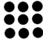
At two minutes